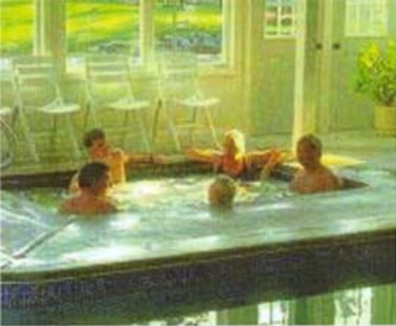
Enjoy our Indoor Spa